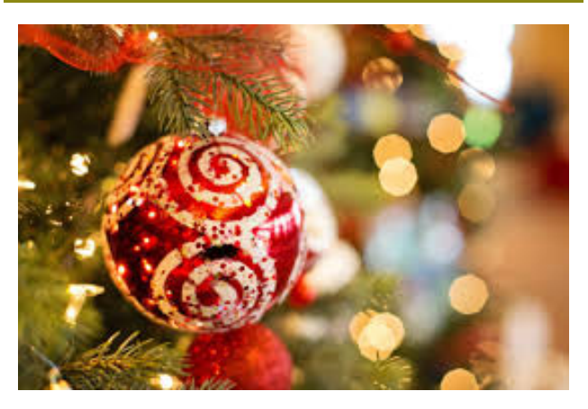
Location to be determined!

You will not want to miss this fun night!